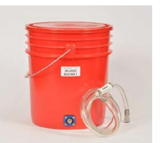
BLOOD FILL SYSTEM